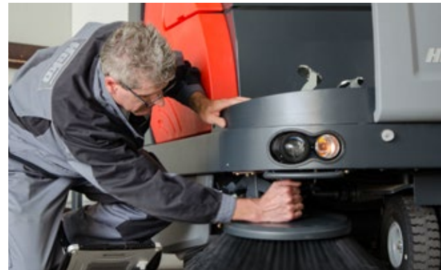
Easy access to all relevant components ensures uncomplicated maintenance and servicing.

Coordinated by a GPS-controlled assignment planning system, 650 field technicians are available for you around the clock to ensure maximum machine availability and minimum downtimes. In addition, our highly efficient spare part logistics guarantees direct over-night delivery of original spare parts.