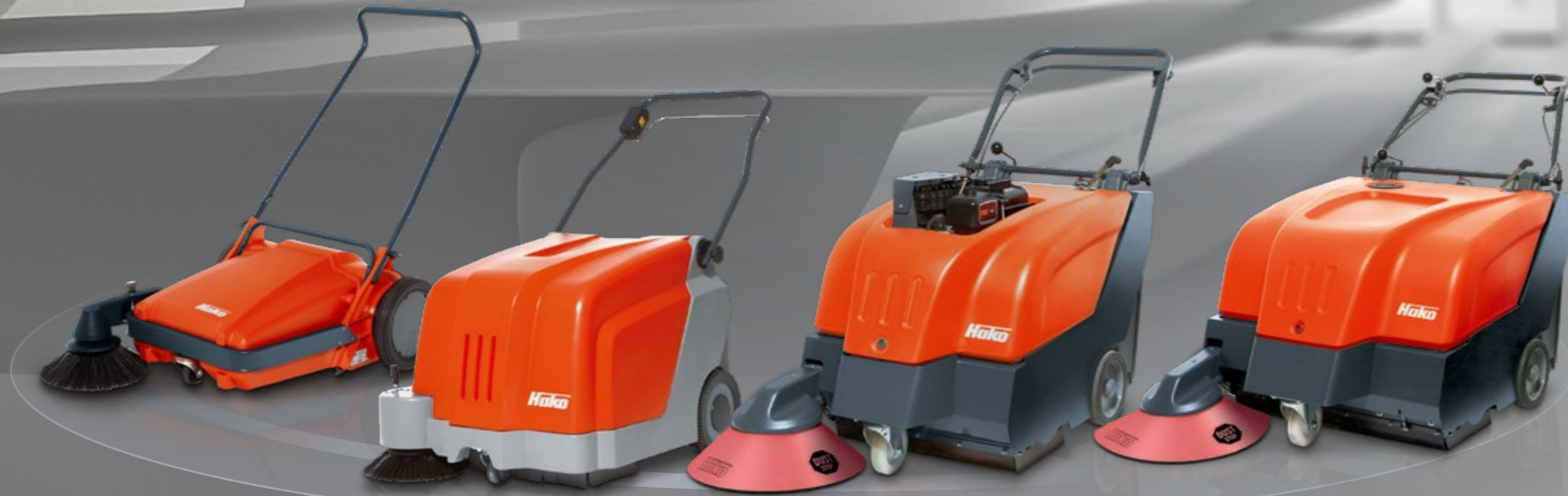
Area performance: from 2,300 to 4,350 m 2 /h