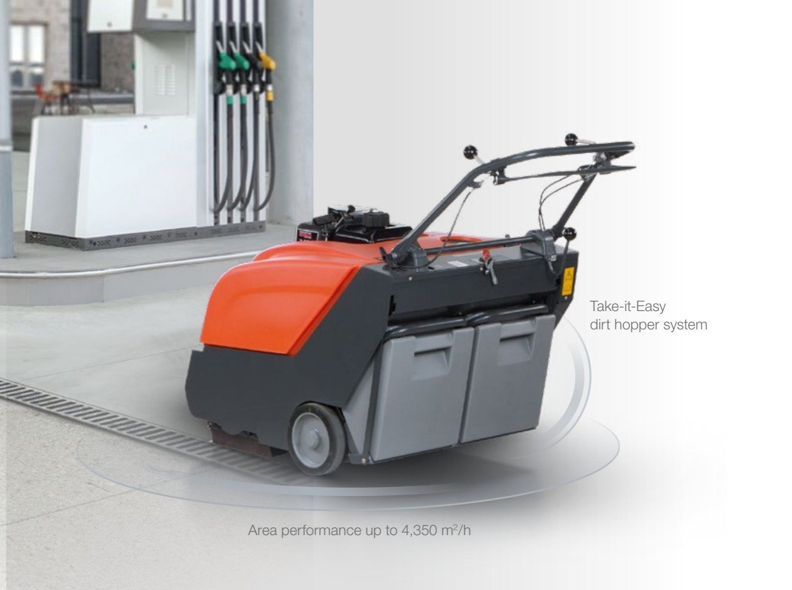
Take-it-Easy dirt hopper system