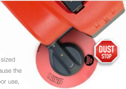
DustStop(option) reduces dust and fine particulate emissions at the side broom by up to 90%.

The Sweepmaster 800 provides cleaning of small to medium-sized areas with excellent results and flexible application options, because the machine is available with an economical petrol engine for outdoor use, or a maintenance-free battery drive for indoor application, as well as an optional Carpet-Kit. Its robust steel frame design is ideal for heavy-duty applications with a convincing area performance of up to 4,350 m 2 /h.