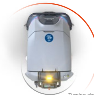
Turning circle d = 130 cm L = 105 cm

The new Scrubmaster B75 i cleans taught routes independently, reliably and safely. The 3D camera system and certified LiDAR sensors not only enable reliable obstacle detection and efficient navigation, but also compliance with safety standards. Operation via the clear 8-inch LCD panel is simple and intuitive. The Scrubmaster B75 i increases productivity as it can perform cleaning tasks at any time of the day or night – particularly efficient, saving time and resources.