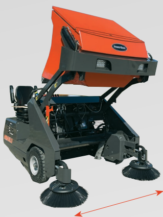
1830mm / 2133mm (width - single side / dual side sweep brush)